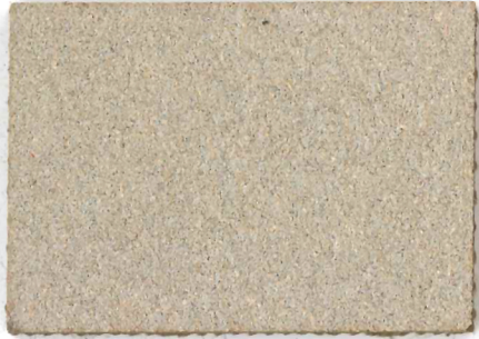
2182 | potato skin * NCS 4005 - Y20R LRV 28%