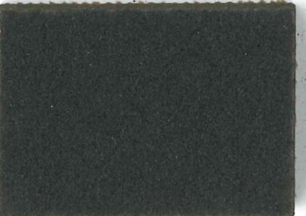
2209 | black olive NCS 9000 - N LRV 5%