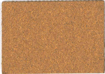
2166 | nutmeg spice * NCS 4030 - Y30R LRV 22%