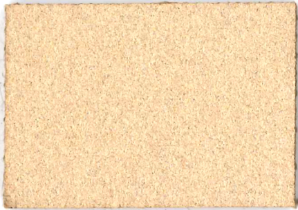
2186 | blanched almond * NCS 3020 - Y20R LRV 34%