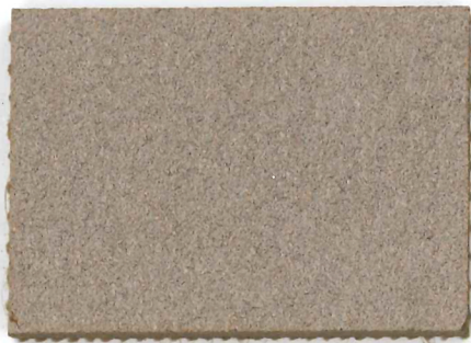
2208 | mushroom medley NCS 5005 - Y50R LRV 21%