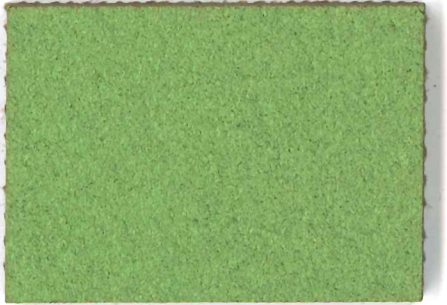
2213 | baby lettuce NCS 4030 - G30Y LRV 23%