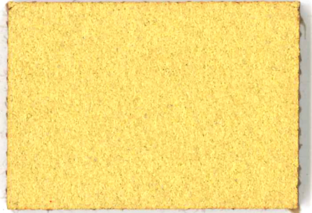
2212 | fresh pineapple NCS 3030 - G90Y LRV 40%