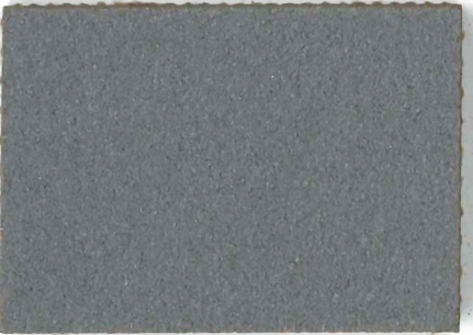
2204 | poppy seed NCS 6500 - N LRV 16%