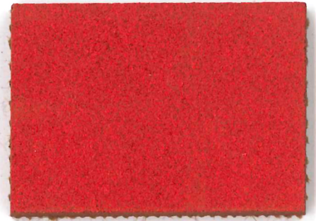
2210 | hot salsa NCS 3560 - Y90R LRV 11%