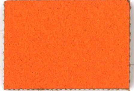
2211 | tangerine zest NCS 2070 - Y60R LRV 20%