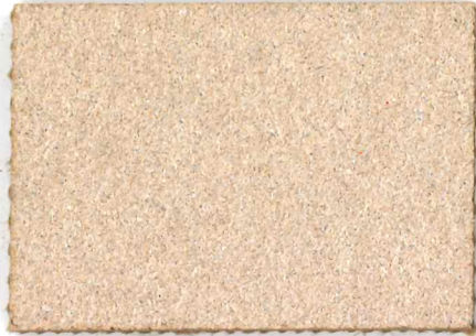
2187 | brown rice NCS 4010 - Y30R LRV 34%