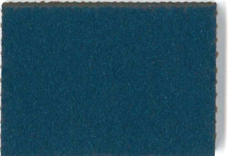
2214 | blue berry NCS 6030 - B LRV 6%