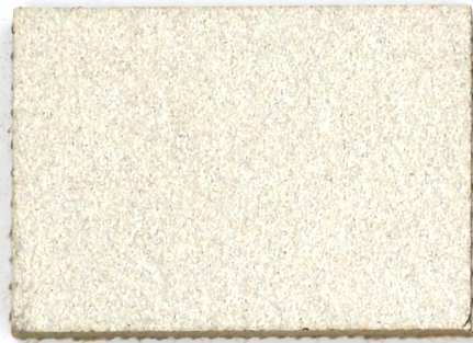
2206 | oyster shell NCS 3502 - Y LRV 43%