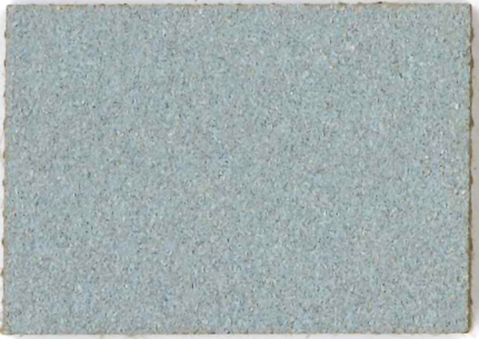
2162 | duck egg NCS 5005 - B80G LRV 25%